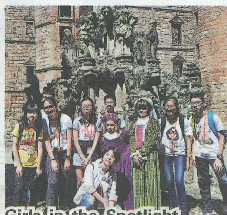
Girls in the Spotlight

This is Linlithgow Palace, a marvelous old palace in Edinburgh. I was not only amazed by the stunning design, but also by the two little tour guides. They were much younger than us, but during the one-hour tour, they were so confident. Wearing the beautiful costumes, they became targets of the tourists. We lined up in order to have the opportunity to take photos with them.