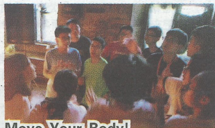
Move Your Body!

We had a disco night which was something absolutely new for me. The disco was held in the school hall. At the beginning, all of us were so shy that nobody dared to come out and dance. However, after a few familiar pop songs, we were all in the mood. We followed the beat and started moving our bodies. Music knows no boundaries, so students from different countries danced together for hours. I really did not want to the music to end.