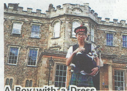
A Boy with a Dress

Yes! I am a boy, but I am wearing a skirt. This is the traditional Scottish costume - kilt. Before the trip, I promised my Principal that I would wear it if there was a chance. In the end, I did. With the bagpipes, I became a Scottish boy. I thought that the tour was an unforgettable experience for me since I learnt about the culture of this place through different activities. My horizons were broadened and my world became greater.